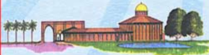
New Planned Masjid