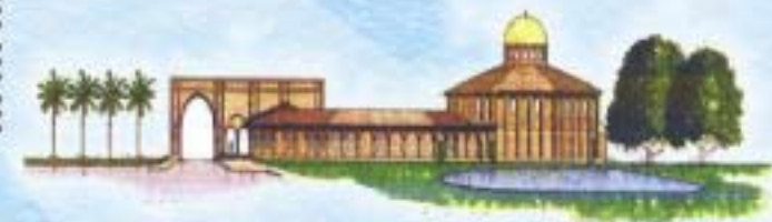
DEPICTION OF NEW ISSB MASJID

Tel/Fax: (001) 941 351-3393 www.issb.net